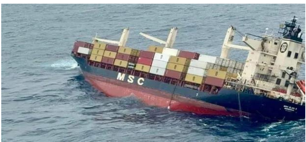
(Initial photo as on 24th May 2025 -)

Three crew members - including the Captain, Chief engineer and Second engineer, who had remained onboard to assist with salvage operations, were rescued by INS Sujata. The remaining 21 crew had been safely evacuated earlier by the Indian Coast Guard (ICG).