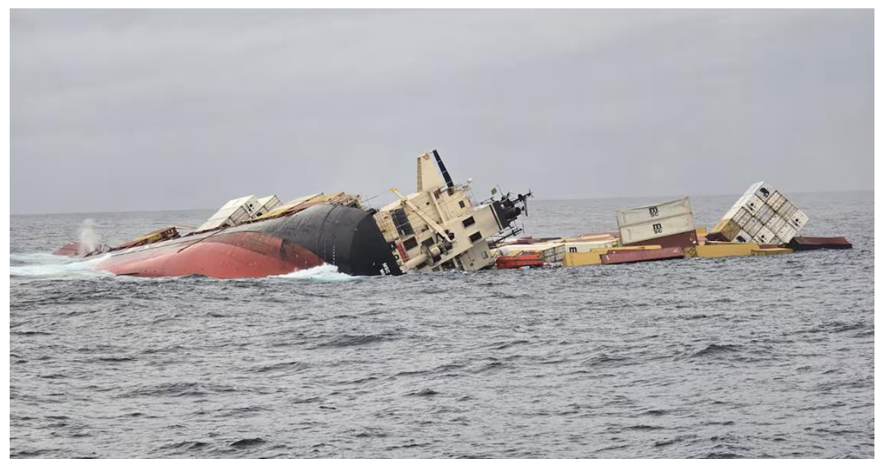
(Situation as on 25<sup>th</sup> May 2025 morning))

The situation worsened since the day of the incident. Subsequently, the Indian Government on Sunday, 25 May 2025 late morning officially confirmed the sinking of Liberian container ship 'MSC ELSA 3' due to flooding.